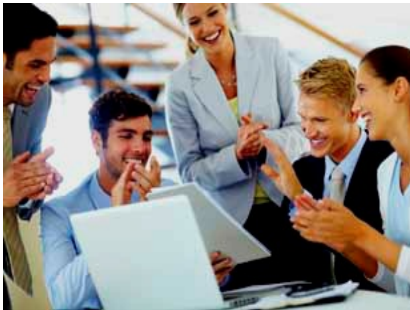
Analysing & Costing